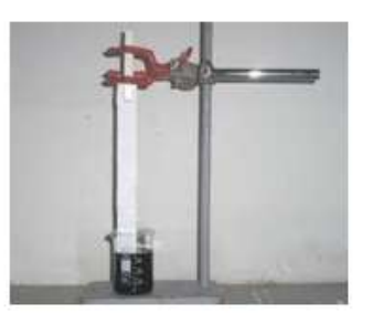
Fig8: wick ability

Wick ability was testing using the manual method. In this test a strip of fabric is suspended vertically with its lower edge in a reservoir of distilled water. The rate of rise of the leading edge of the water is then monitored at different timings. The measured height of rise in a given time is taken asa direct indication of the wick ability of the test fabric. The measured height of water rise and wick ability test fabric absorbency values were calculated.