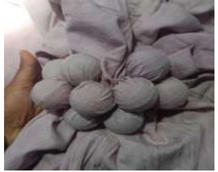
Fig 5: Bubble effect

Fabrics with bubble effects can be visually appealing and provide a tactile texture that some babies may find interesting. Baby feel more comfortable while sleeping .using industrial starch tying a small ball and dip the tied fabric in starch solution and sundry the fabric for effect.