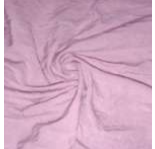
Fig2: Bamboo Dyed fabric

Let the fabric simmer in the dye solution for about an hour, or until you achieve the desired color intensity.